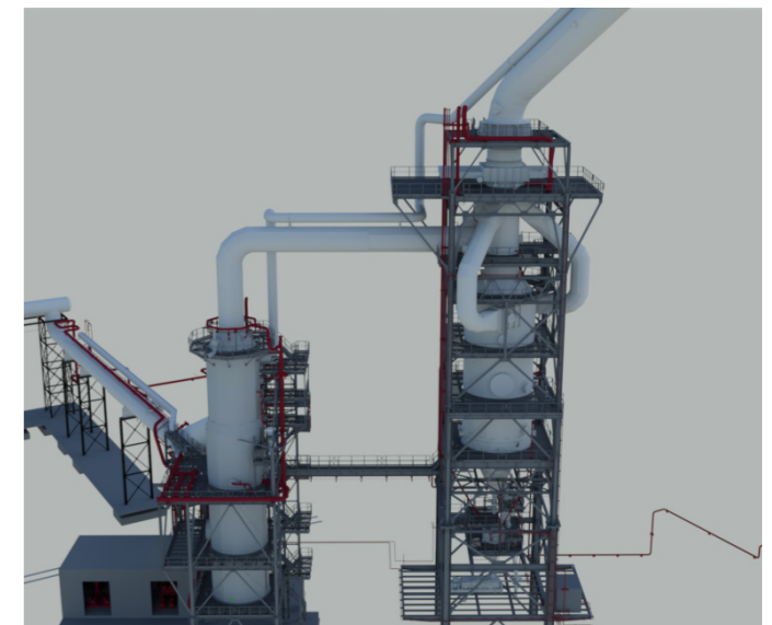
3D model of the future ArcelorMittal Dąbrowa Górnica plant