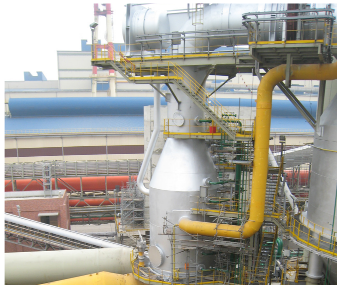
Gas cleaning plant at Dragon Steel BF 1