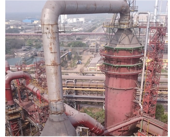
New Davy Cone Scrubber installed inline with existing spray tower