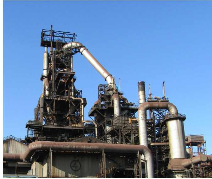
Tri-Ax Cyclone and modified downcomer